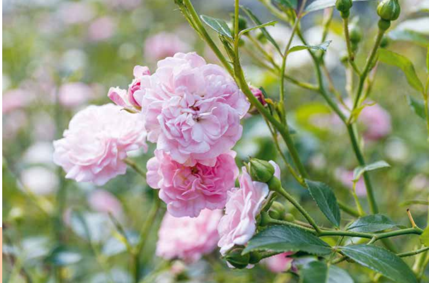
ROSA 'THE FAIRY'