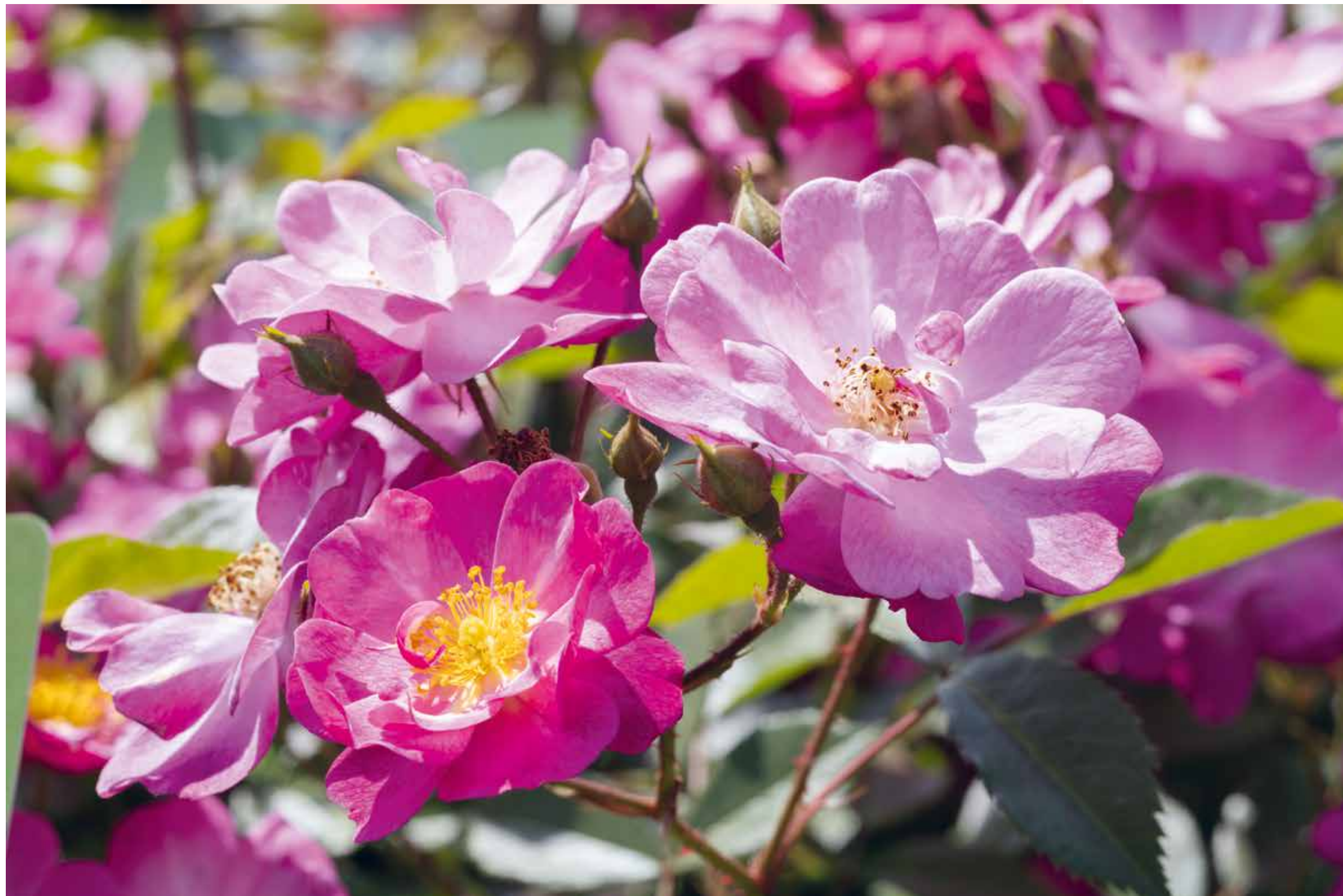
ROSA 'LAVENDER DREAM'

'Angela', 'Bonica', 'Lavender Dream', 'Pearl Drift', 'Penelope', 'Purple Breeze', 'Rosy Cushion', 'Rush', 'Symphonica', 'Westzeit' and 'White Fleurette'.