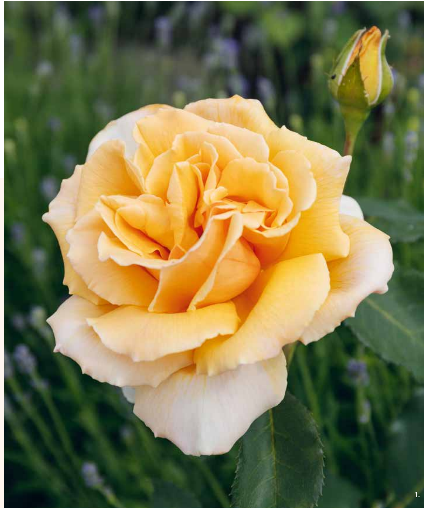
1. ROSA 'JUST JOEY' 2. ROSA 'QUEEN ELIZABETH'

Popular grandiflora roses are 'Audrey Wilcox', 'Dame de Coeur', 'Just Joey', 'Peace' and 'Queen Elizabeth'.