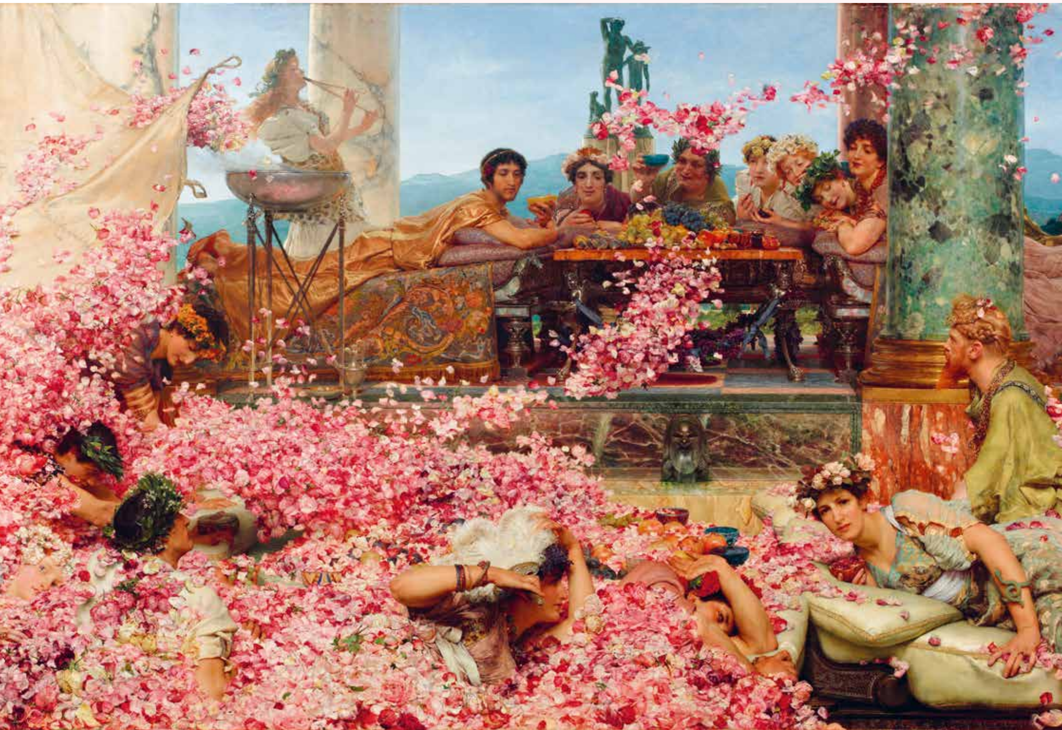
LOURENS ALMA TADEMA THE ROSES OF HELIOGABALUS (1888)