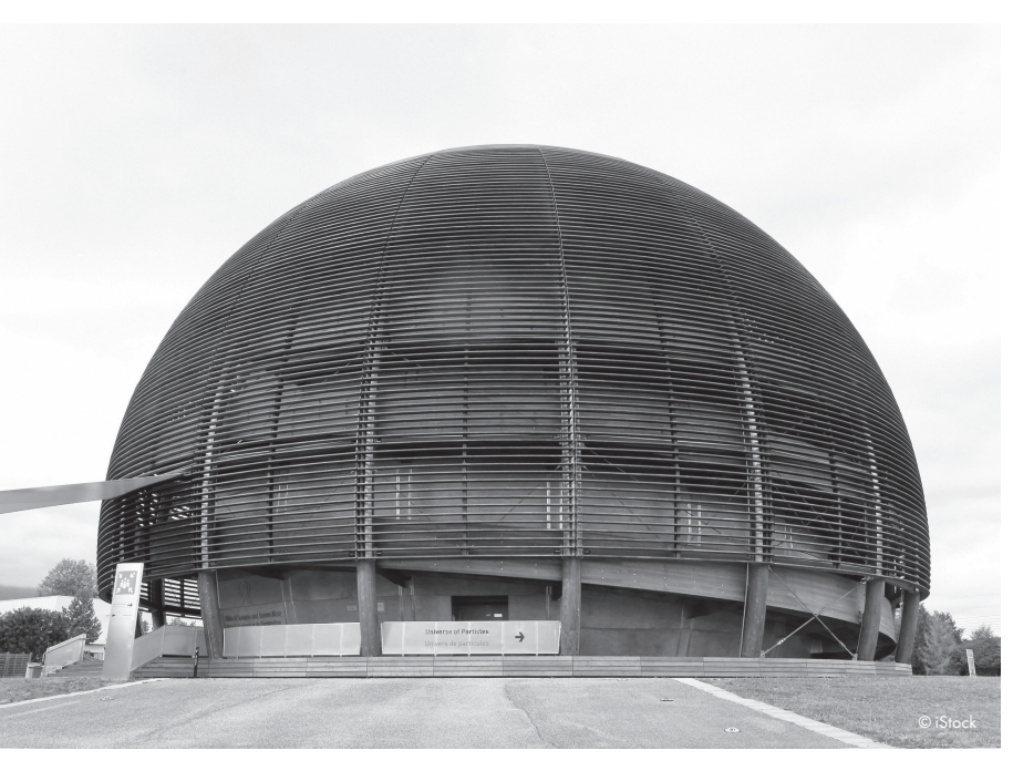
Europe, the capital of Digitalis? With CERN, the European Organization for Nuclear Research, Europe is already a front-runner when it comes to scientific research.