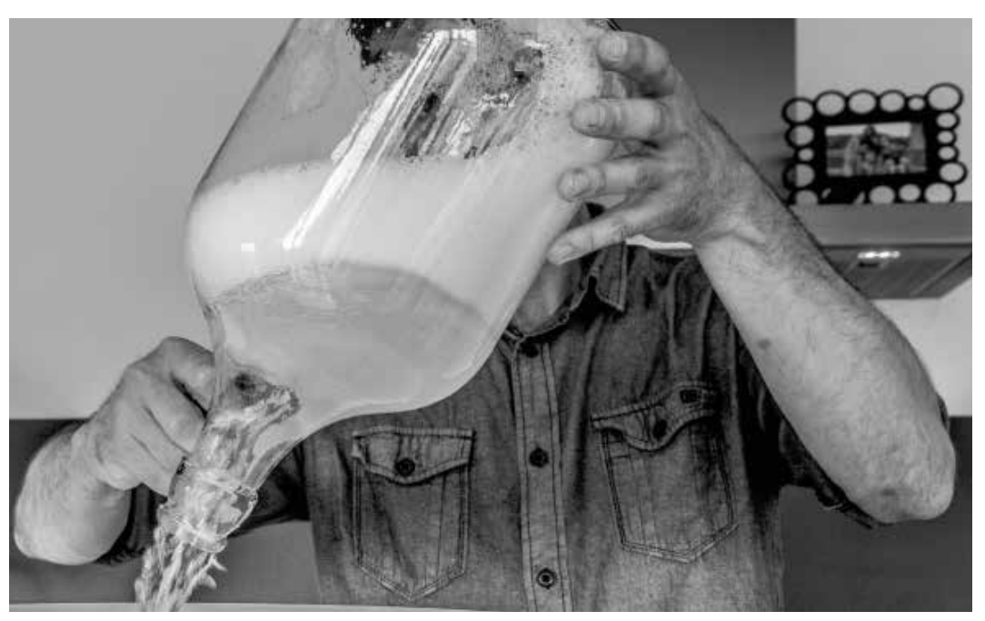
On top of a 30-litre fermentation bucket I also use a 5-litre demijohn to experiment.