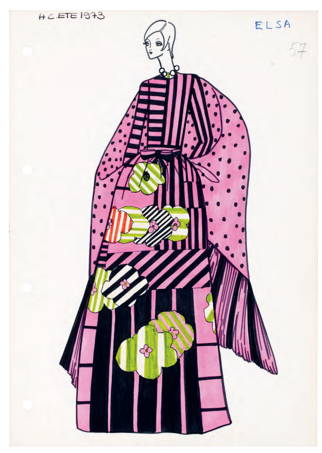
fig. 148 | Elsa model sketch, Lanvin 1973 Spring–Summer Haute Couture collection. Lanvin heritage.