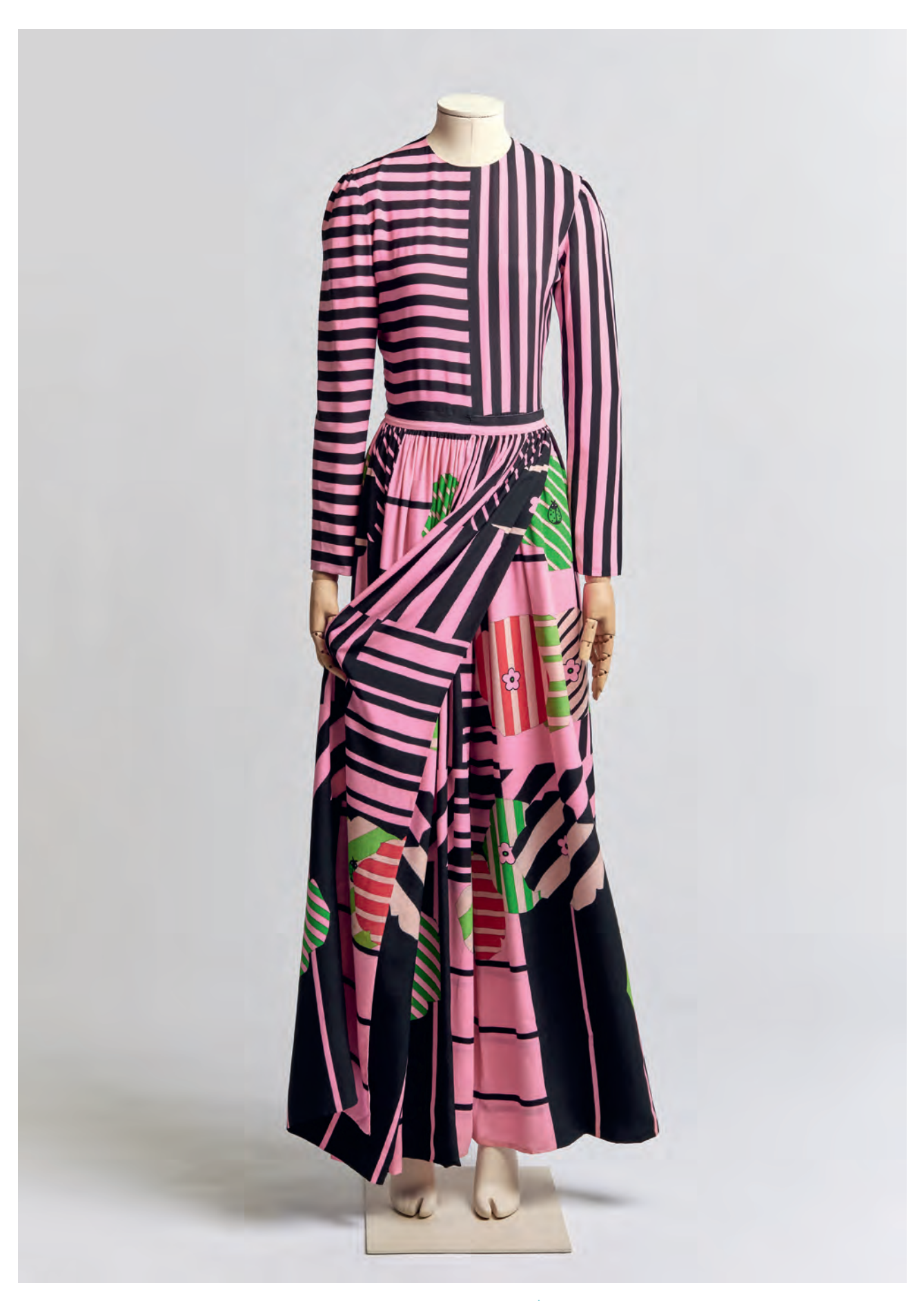
fig. 149 | Elsa, Lanvin 1973 Spring–Summer Haute Couture collection. FLM collection.