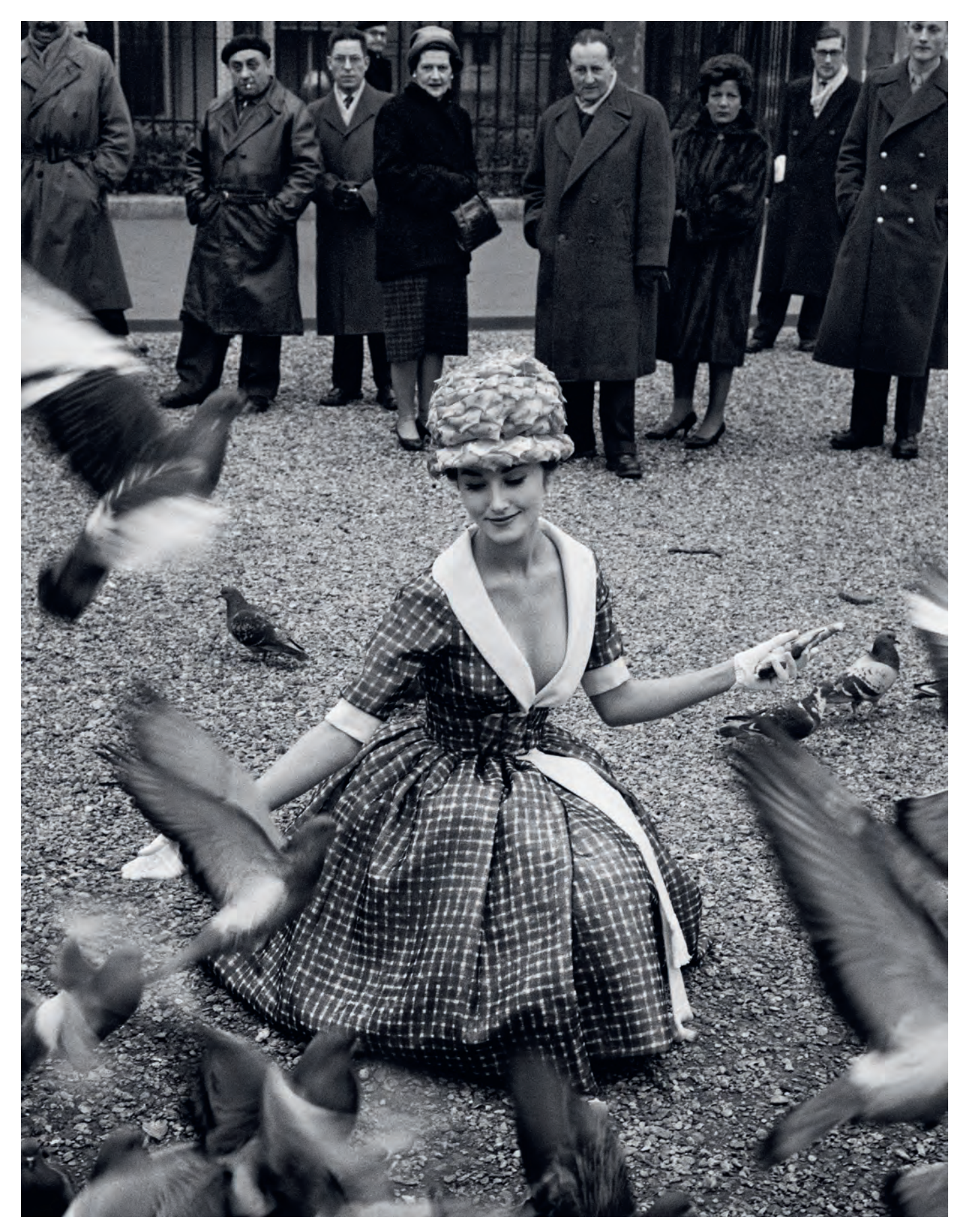
fig. 71 \mid Nina Ricci 1959 Spring–Summer Haute Couture collection.