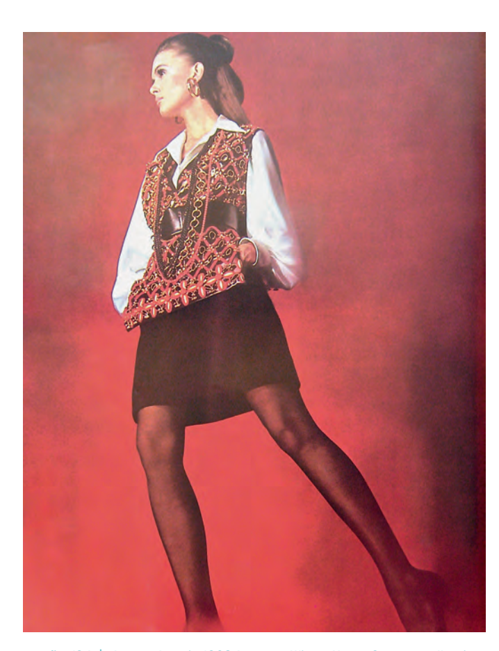
fig. 124 | Jeanne Lanvin 1968 Autumn–Winter Haute Couture collection.