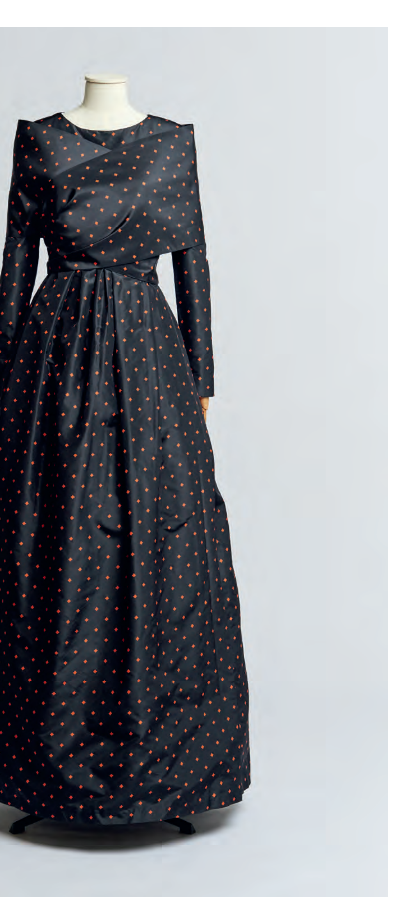
fig. 166 | Marie-Antionette , Lanvin 1976 Autumn–Winter Haute Couture collection. FLM collection.