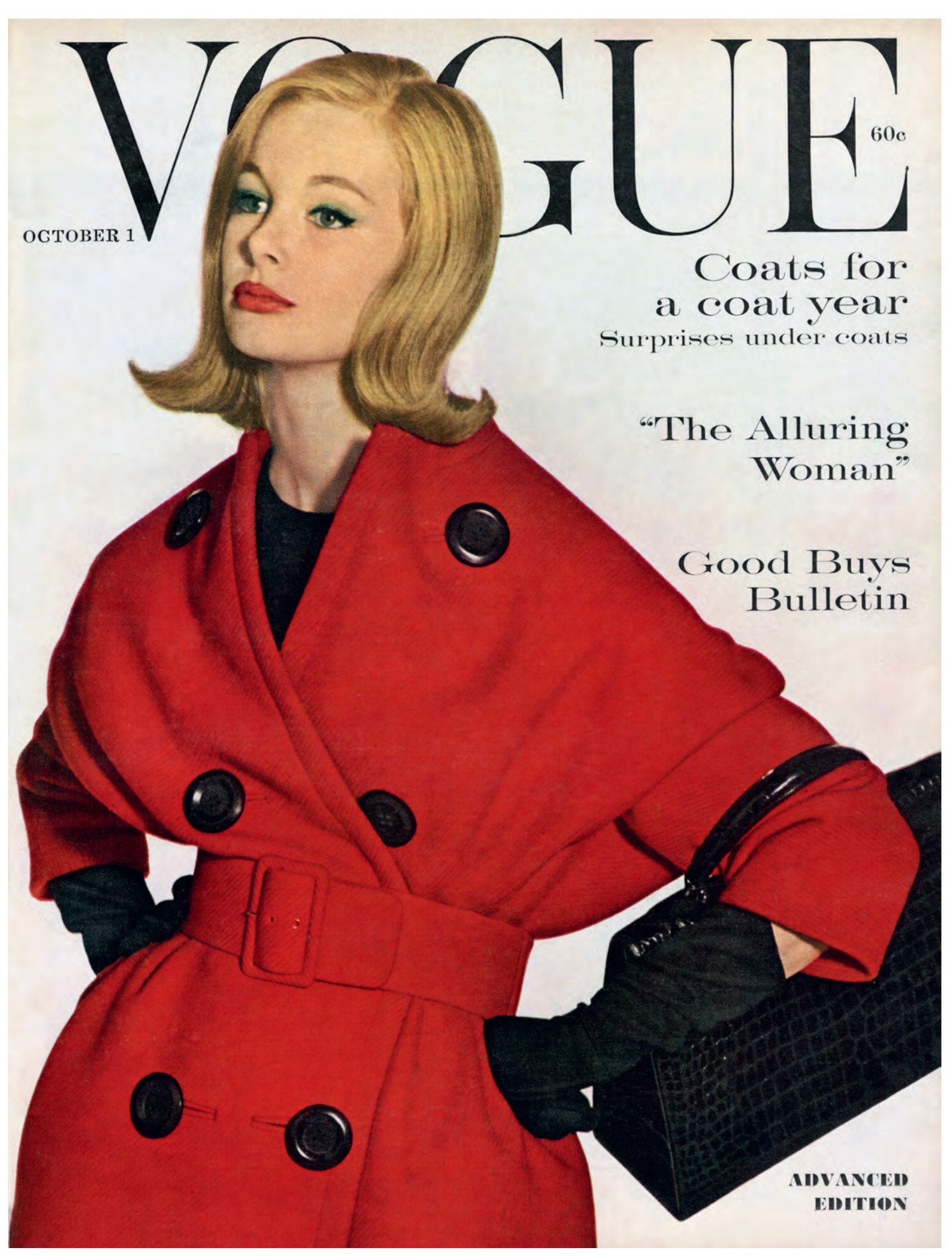
fig. 20 | Vogue US, October 1959, coat from the Nina Ricci 1959 Autumn-Winter collection.