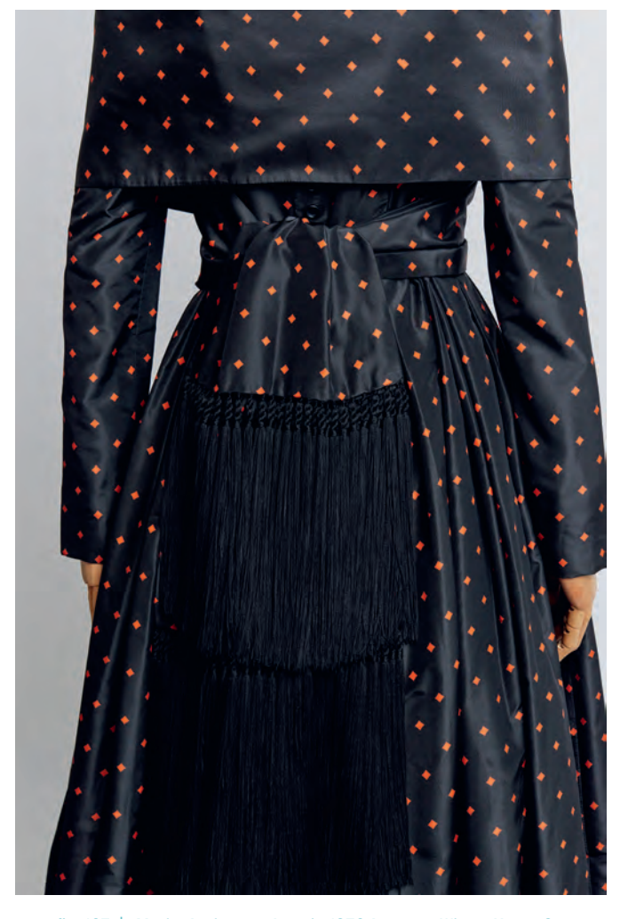
fig. 167 | Marie-Antionette , Lanvin 1976 Autumn–Winter Haute Couture collection. Detail from the FLM collection.