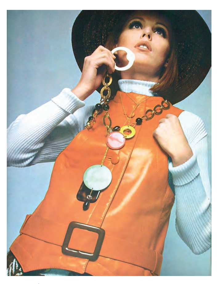
fig. 123 | Jeanne Lanvin 1968 Spring–Summer Haute Couture collection.