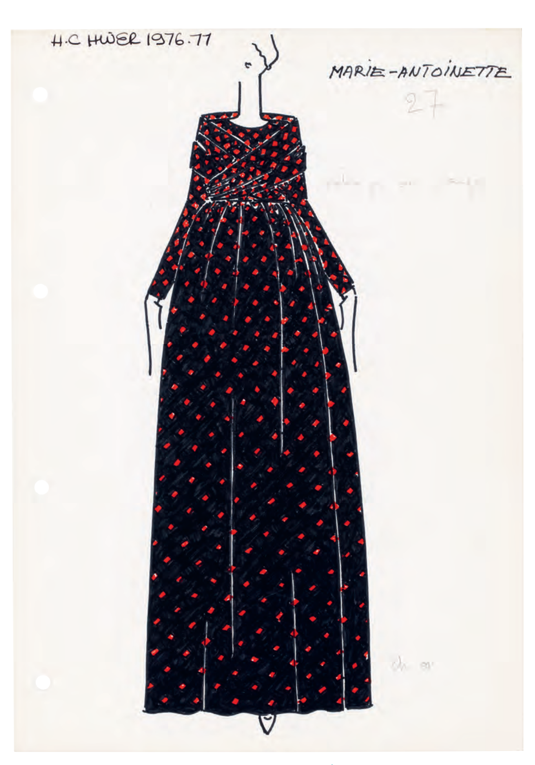
fig. 165 | Marie-Antionette model sketch, Lanvin 1976 Autumn-Winter Haute Couture collection. Lanvin heritage.